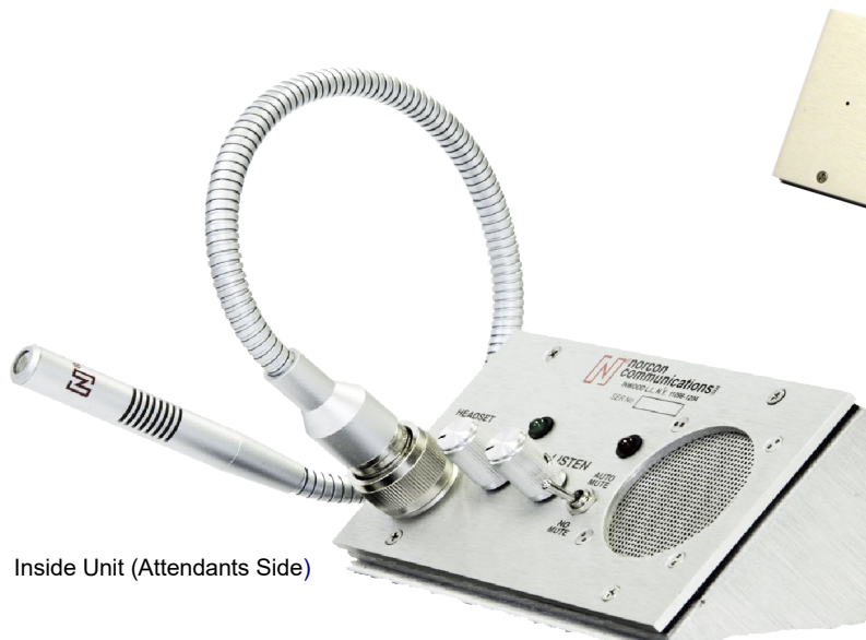
Inside Unit (Attendants Side)